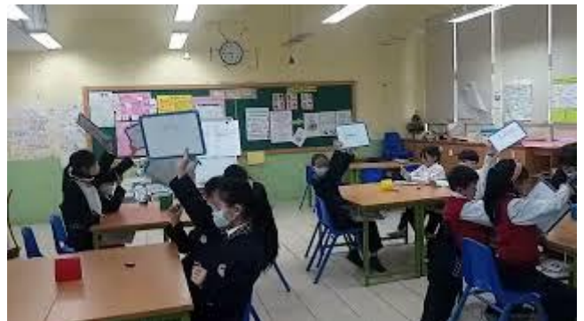
Superlative Adjective Group Game