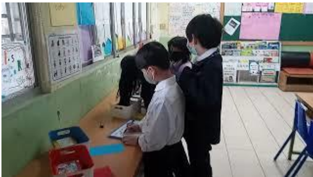
Cardinal Direction Scavenger Hunt