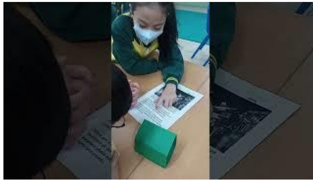
Group Reading Comprehension

本月，綠組信班的學生們透過獨立和分組的方式來培養閱讀能力。學生以小組為單位，努力準備指定閱讀內容的口頭報告。學生利用這些閱讀內容找出有關當地景點的重要資訊，並運用在他們的說服性寫作上。學生主動帶領小組完成報告，展現出很強的合作能力。其他影片還包括更多提升其他技能的活動，例如：按照指示來進行尋寶遊戲，以及有關最高級形容詞的文法遊戲。