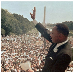
Dr. King waves to the crowd in Washington, D.C., before he gives an important speech.