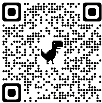
ESL - Paragraph writing - The Burger Method

學生們可以使用 Quizlet 復習第 5 單元：世界各地的慶祝活動的詞彙。這些可用於配對遊戲、抽卡遊戲和簡單的測試。