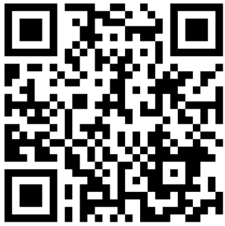
Letter LI Little Fox